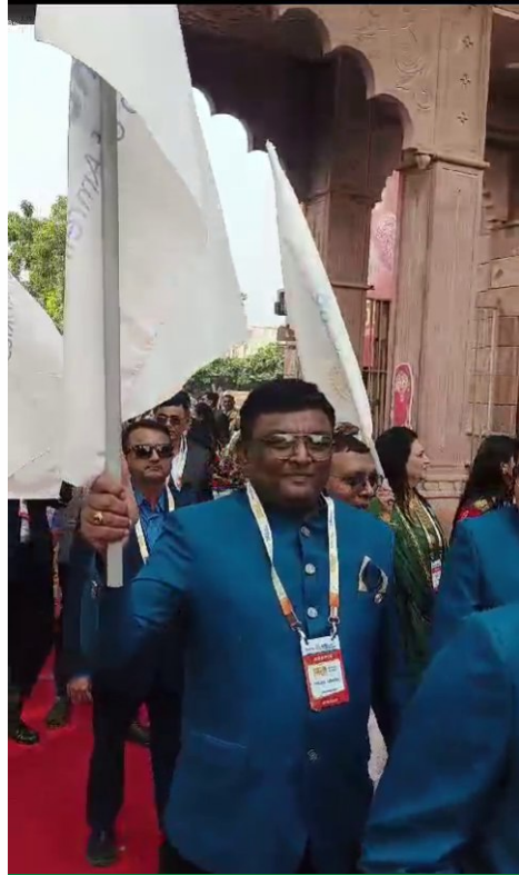
Click here to watch a video