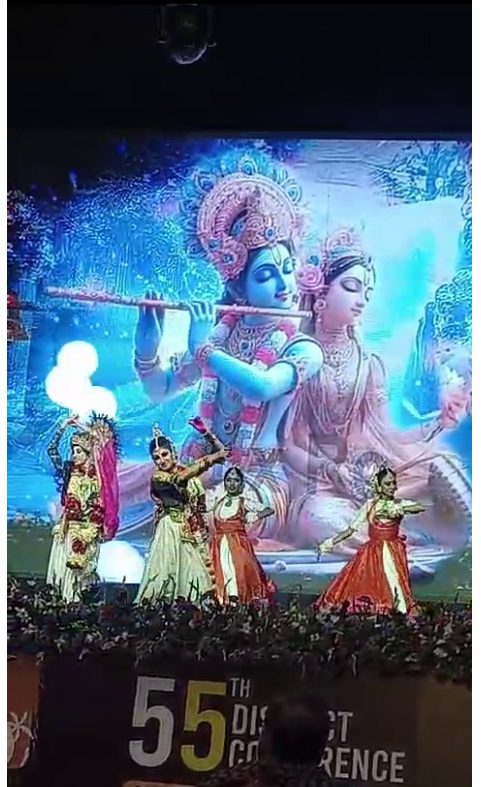
Click here to watch a video